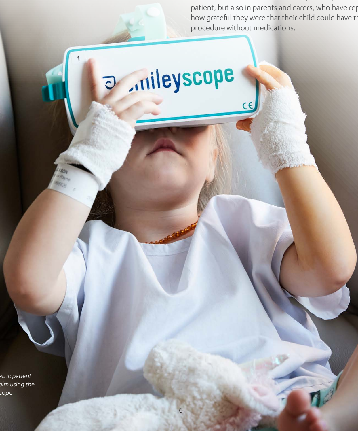
A paediatric patient keeps calm using the Smileyscope

The benefits have been seen in not just the paediatric patient, but also in parents and carers, who have reported how grateful they were that their child could have the procedure without medications.