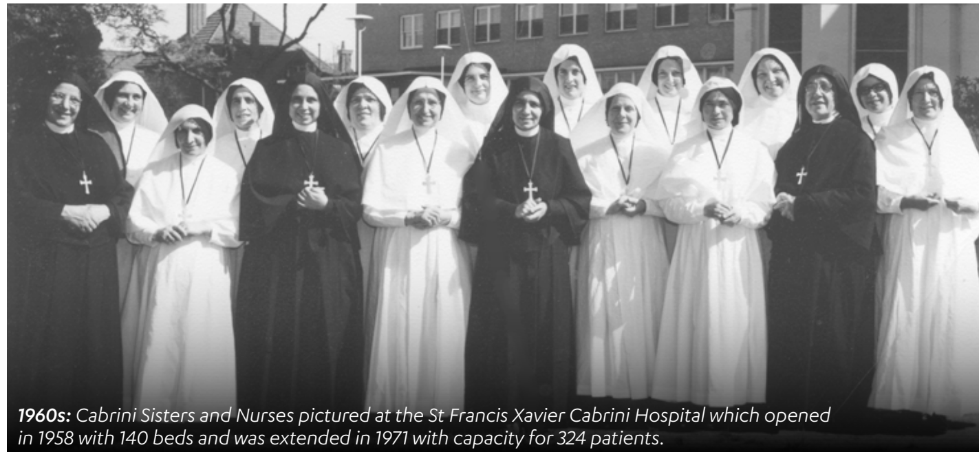
1960s: Cabrini Sisters and Nurses pictured at the St Francis Xavier Cabrini Hospital which opened in 1958 with 140 beds and was extended in 1971 with capacity for 324 patients.

You connect our past to the future, which future generations will inherit from us. You embody the spirit of Cabrini. And through a gift in your Will, you are its guardian too.