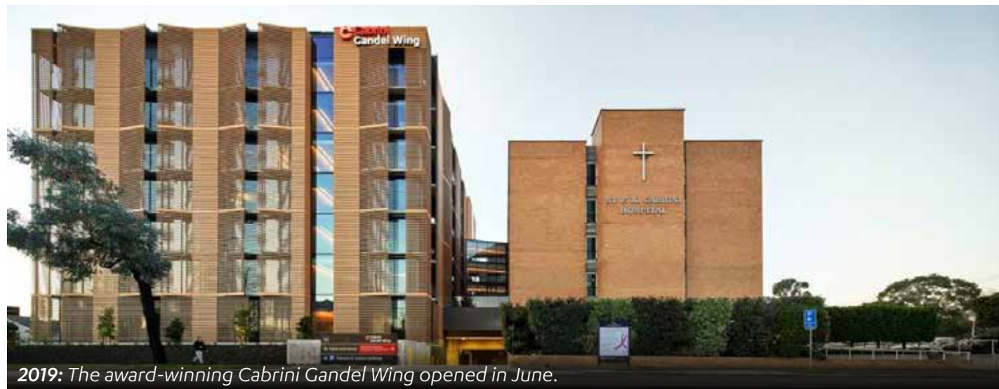
2019: The award-winning Cabrini Gandel Wing opened in June.