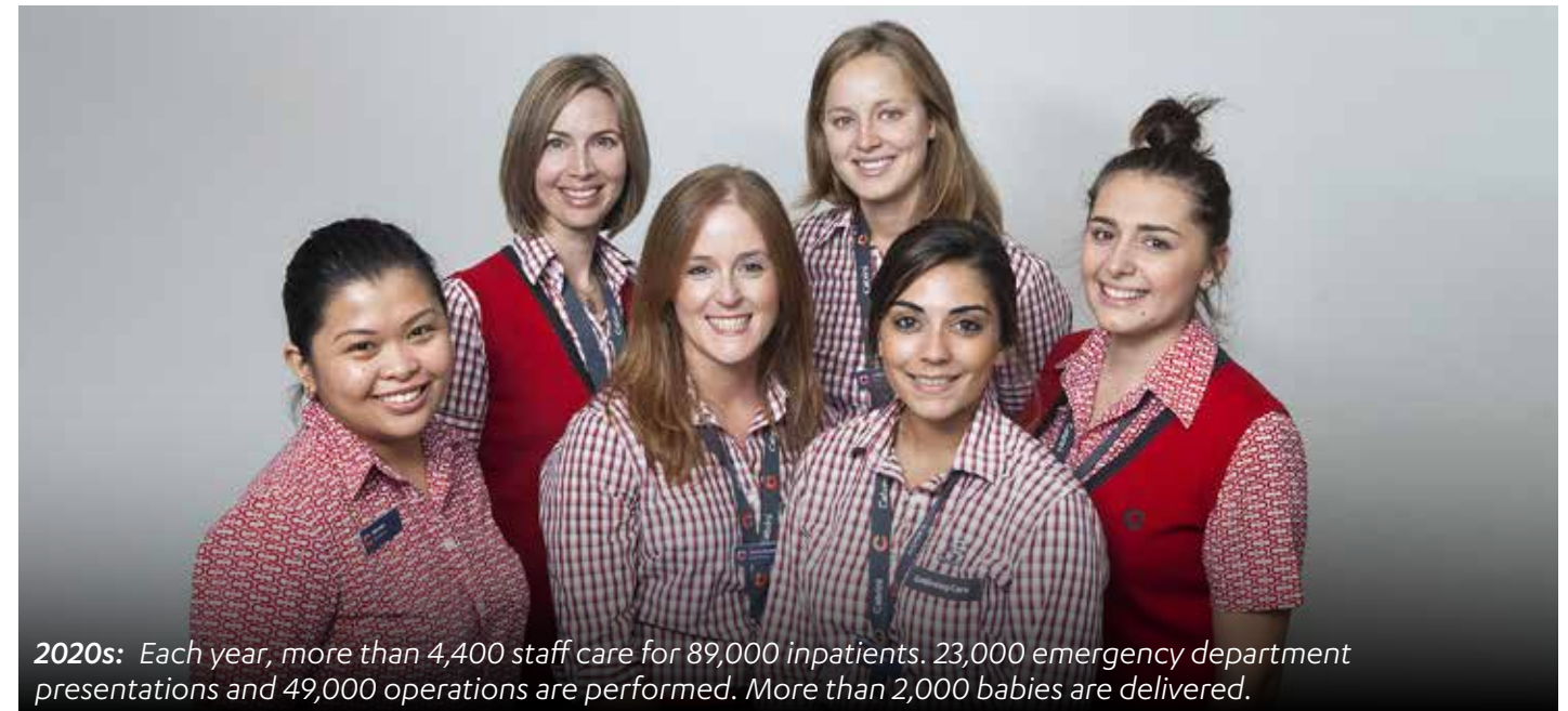
2020s: Each year, more than 4,400 staff care for 89,000 inpatients. 23,000 emergency department presentations and 49,000 operations are performed. More than 2,000 babies are delivered.

Your legacy today will ensure Cabrini's compassion and care, research, refurbishment, new facilities and equipment will continue to deliver life-changing services for the people who need it tomorrow and beyond.